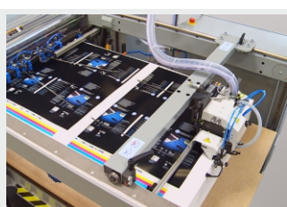
Komfi-design feeding head - feeding from pallet